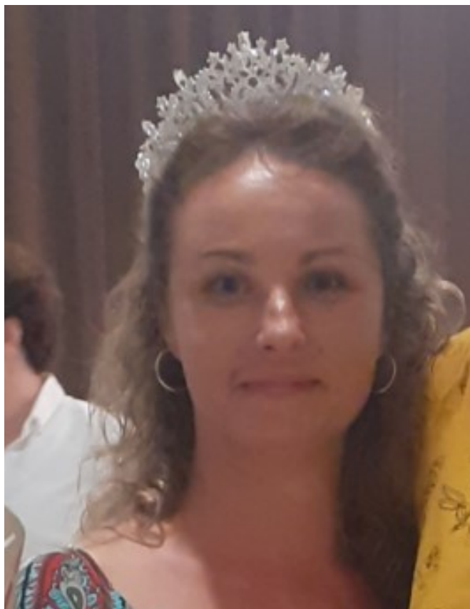
Lara-tiara is awarded to the best lady in Lara mixed pairs