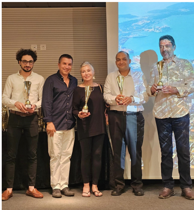
Open Team winners.